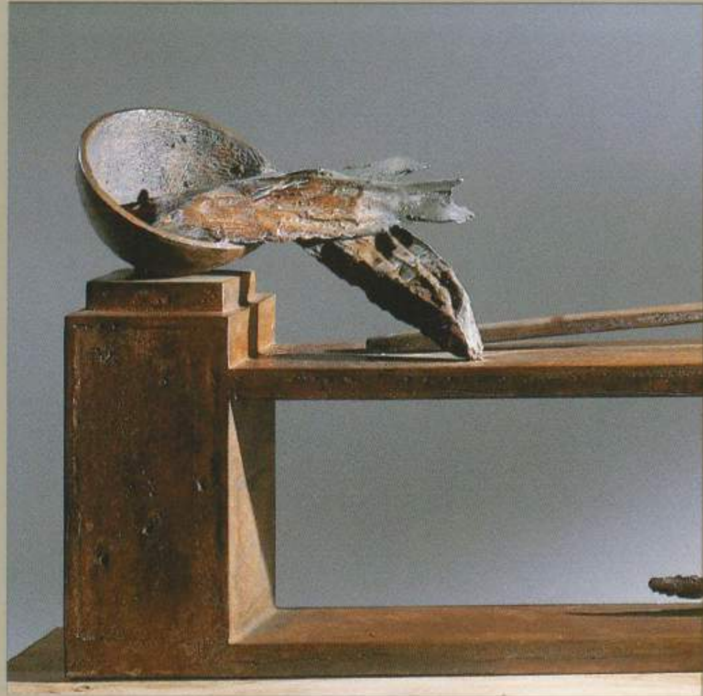
this page: detail of Still Life #1 opposite: Still Life #1 , 1988 bronze 19" x 80" x 5½" deep